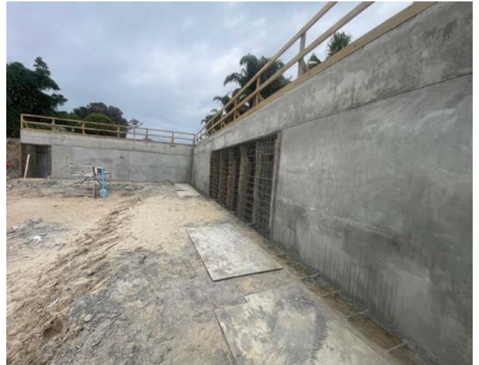
THE PITAU, MOUNT MAUNGANUI