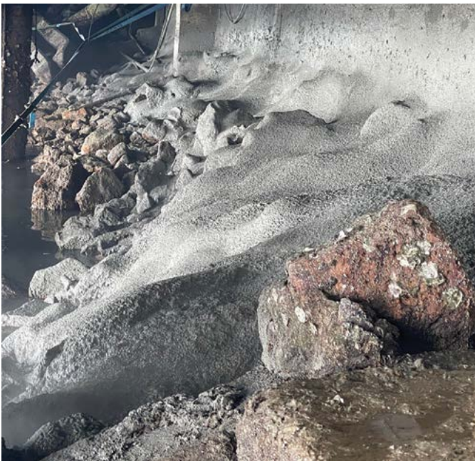
SEA WALL REPAIRS THE STRAND, TAURANGA

We provide complete concrete pumping solutions tailored to meet the specific needs of any project with precision and efficiency, including large-scale commercial and industrial projects, such as warehouses and supermarkets, infrastructure projects for roads, bridges, marine walls and tunnels, high-rise buildings, retirement villages and residential homes.